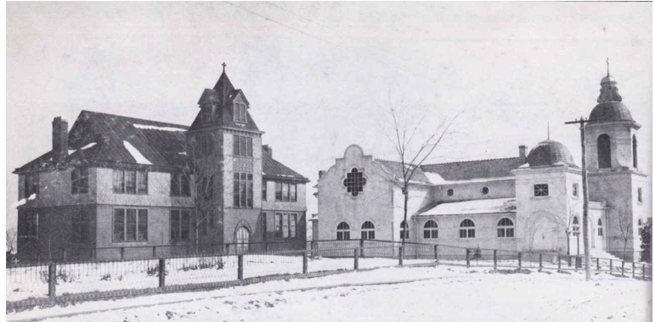
Original Mission building on left and “New” Church