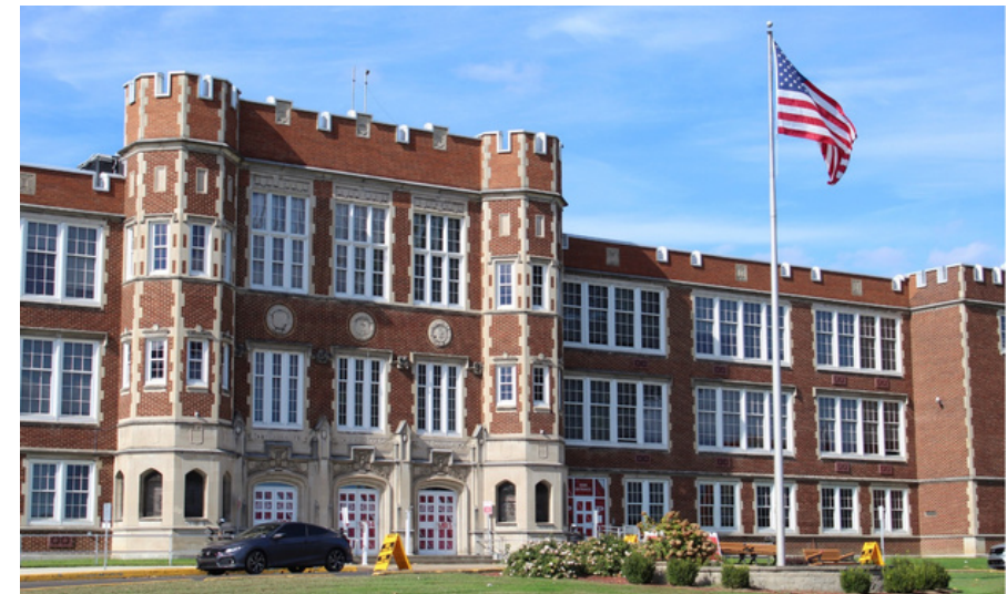
Parkersburg High School