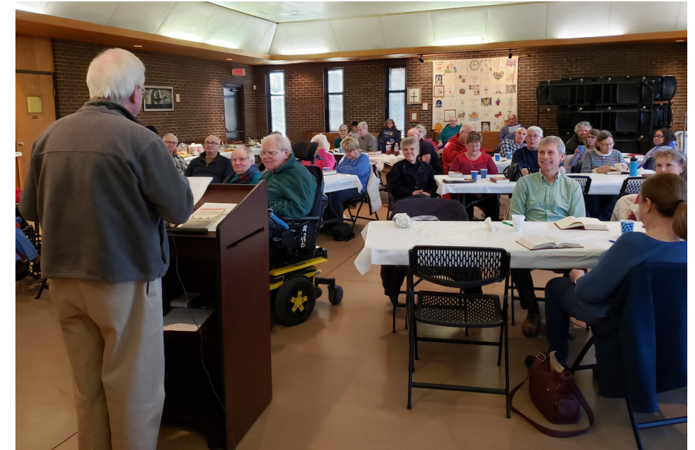
2024 Lenten Series

At various times through the year, such as during Advent and Lent, our Rector offers different topics to help further our understanding of our faith, Episcopal traditions and a more informed understanding of the Gospel.