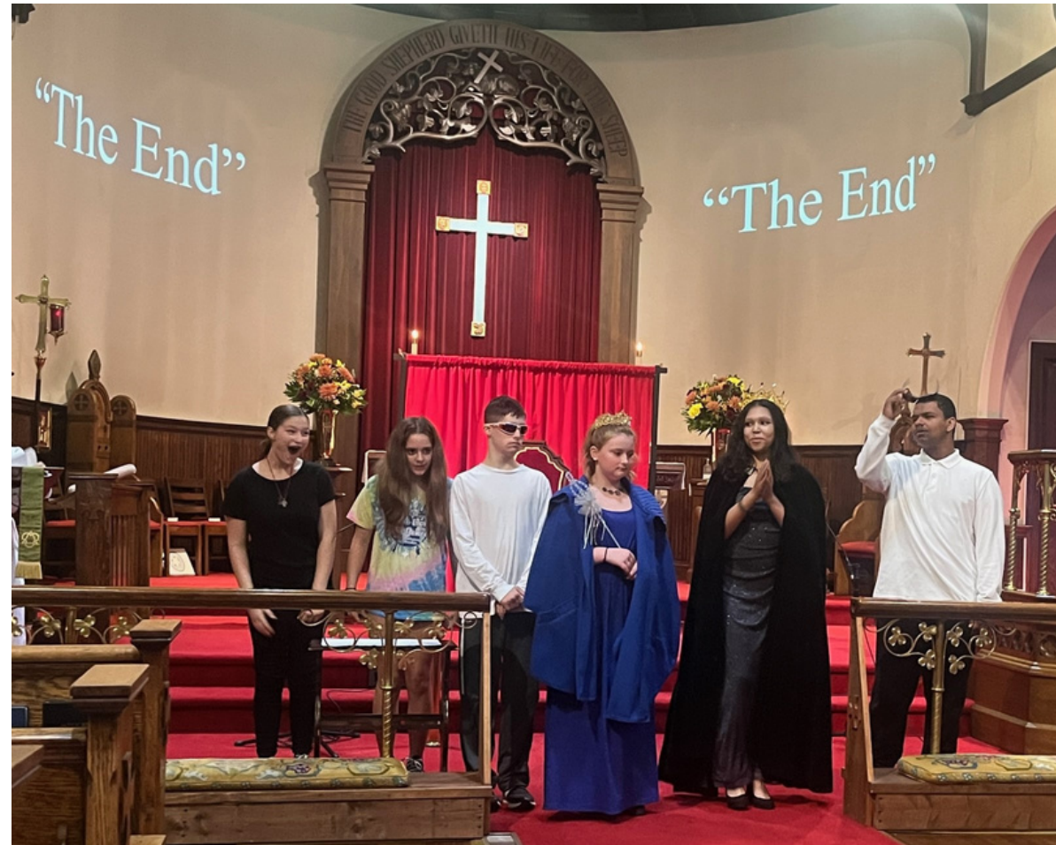
Good Shepherd Drama Group October 2023