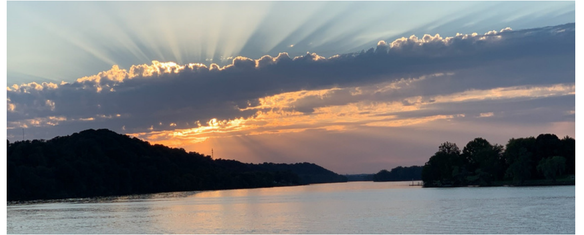
View From Point Park, Parkersburg

We have three options for air travel. Our local airport offers direct flights to Charlotte, NC with connections throughout North America, the Caribbean and Europe. Or we can take flights out of Charleston, WV and Columbus, OH to cities throughout the U.S and beyond. We are also at the intersection of I-77 and US 50, major highways that provide easy access to cities such as Columbus, Pittsburgh, Cleveland, and Cincinnati.