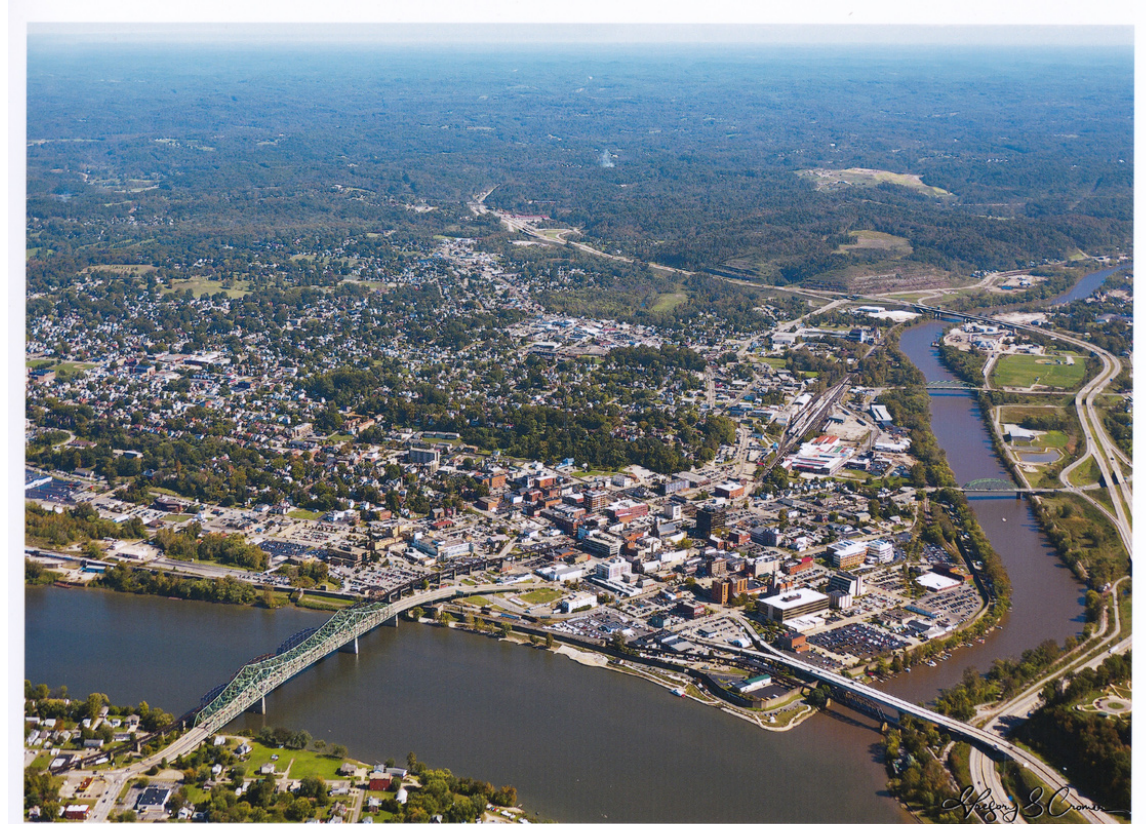
Parkersburg West Virginia

A stereotype of West Virginia is rarely complimentary, but many who move to the area become attached and remain here after they retire. Their children have fond memories of growing up, attending school, taking part in sports, the arts, or hiking or biking. Many think this is a good place to live and raise their children. Here's why we think so too! In the first place, it's because of the people here. They are friendly, care for each other, are easy-going and generous. Their commitment to the communities they live in runs deep. Schools, stores, and medical care are close by. No matter where you are or where you are headed, it is likely to be less than a 20-minute drive away.