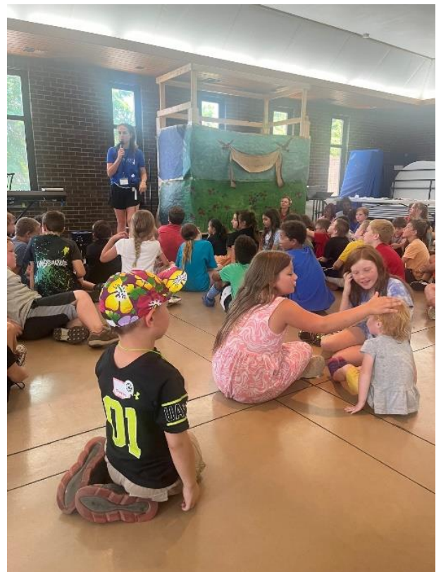
Celebration for families and friends