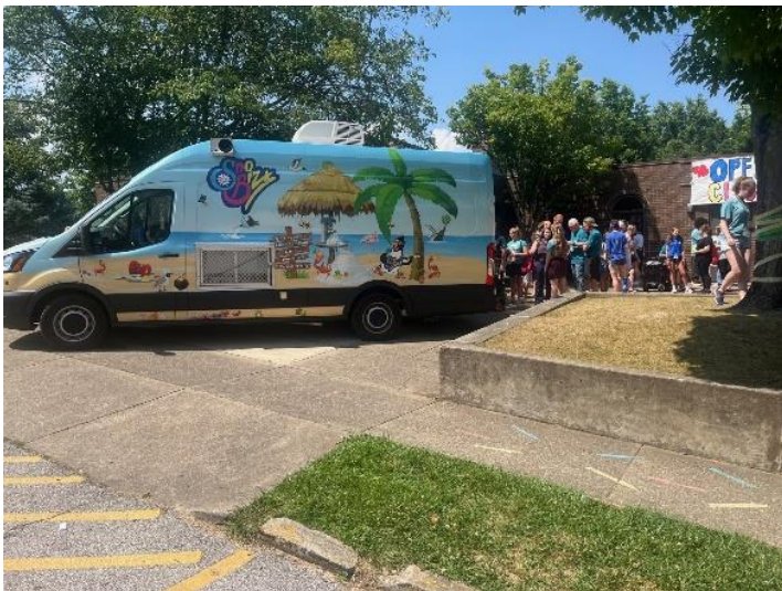
Last day Sno-Cones