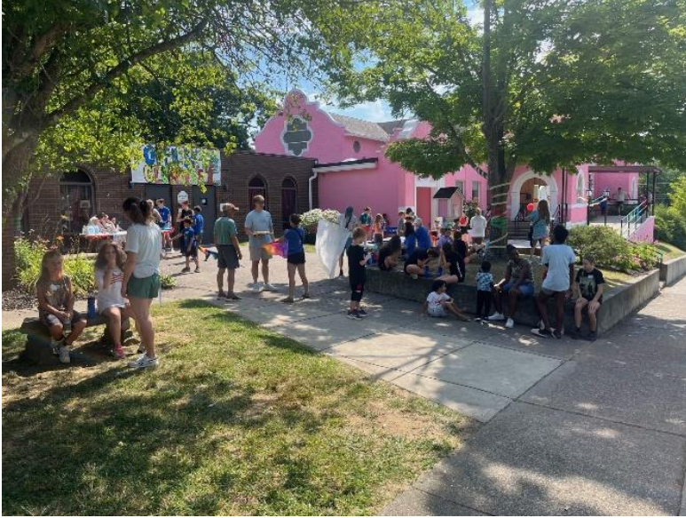
Staying cool (er) in the shade